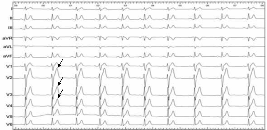
FIGURE 1. An electrocardiogram of a patient with short QT syndrome shows sinus rhythm and a rate of about 80 bpm. Note the QT interval of about 280 ms and the corrected QT interval of about 320 ms. Also note the tall and peaked T waves, especially in leads V 2 to V 4 (arrows). These T waves might be interpreted as R waves by an implantable cardioverter-defibrillator and therefore provoke inappropriate shocks from the device (see text for details). (Paper speed 25 mm/sec; each 1 mm represents 0.04 seconds.)

REPRODUCED FROM MORENO-REVIRIEGO S, MERINO JL. SHORT QT SYNDROME. E-JOURNAL OF THE EUROPEAN SOCIETY OF CARDIOLOGY COUNCIL FOR CARDIOLOGY PRACTICE 2010; 9, WITH PERMISSION FROM THE EUROPEAN SOCIETY OF CARDIOLOGY. HTTP://WWW.ESCARDIO.ORG/COMMUNITIES/COUNCILS/CCP/E-JOURNAL/VOLUME9/PAGES/SHORT_QT_SYNDROME_REVIRIEGO.ASPX#.UFIL-O1M518 . ACCESSED OCTOBER 23, 2012.