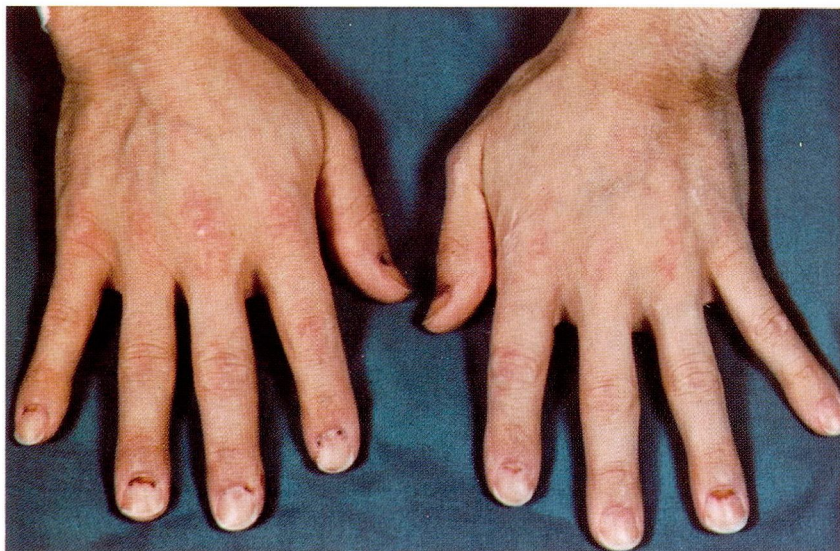
Fig. 2. Case 4. Periungual infarcts.

On admission to Cleveland Clinic he was acutely ill. Examination of the skin revealed