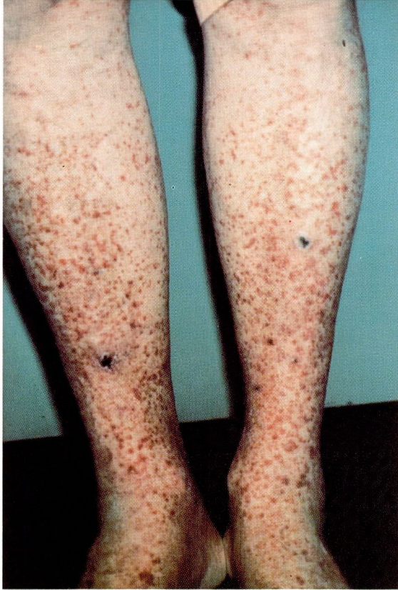
Fig. 3. Case 4. Cutaneous vasculitis with palpable purpura.