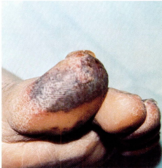
Fig. 4. Case 4. Infarction of the great toe.