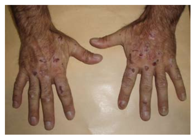
FIGURE 1. Crusted erosions, milia, scars, and considerable hair growth on sun-exposed surfaces of both hands.

64-YEAR-OLD MAN PRESENTS with a 10-day history of painful vesicles and erosions on the dorsa of the hands that appeared after sun exposure (FIGURE 1). He reports that for the past year he has noticed hyperpigmentation and periorbital hypertrichosis (FIGURE 2). He has a history of alcohol abuse and chronic hepatitis B and C infection, and he smokes twenty cigarettes (one pack) per week. He is not taking any medications.