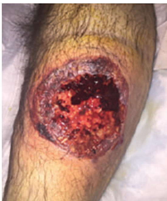
Figure 1. The ulcer at presentation.