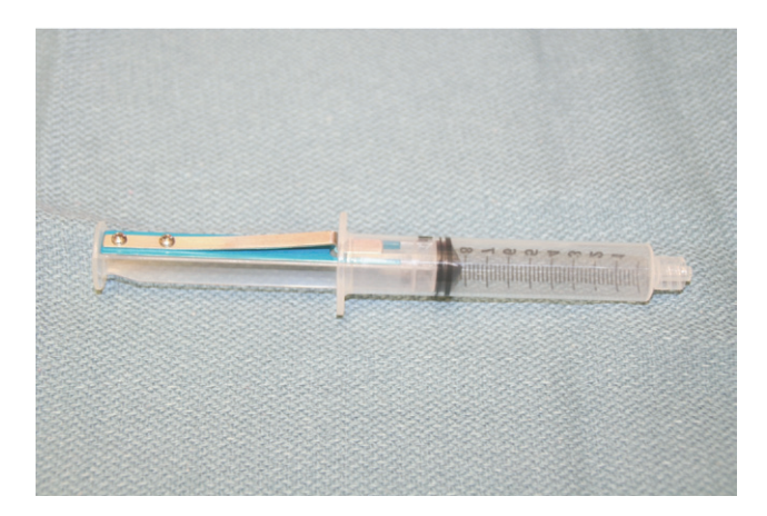
Figure 3 Locking device, manual syringe suction. (Color version of figure is available online.)

Ultrasound assisted liposuction (UAL) was developed by Zocchi in the 1980s to improve the penetration through fat including fibrous areas while decreasing the work of the surgeon. The rapidly vibrating instruments were designed to emulsify adipocytes, creating subcutaneous microcavitations before aspiration. An ultrasonic generator is used to convert electrical energy to vibration using a piezoelectric crystal in the hand piece at a frequency of 20 to 30 kHz. These ultrasonic waves cause repetitive expansion and passive contrac-