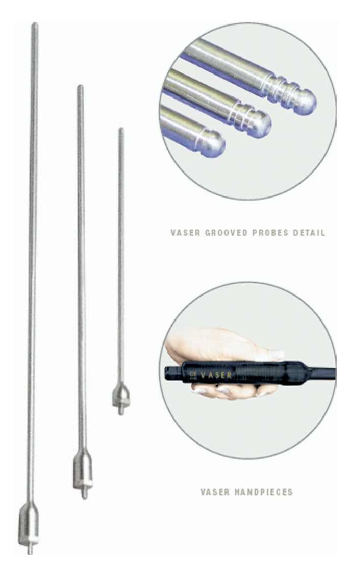
Figure 5 VASER ultrasound-assisted liposuction device. Ultrasonic probe with small grooves to disperse vibratory energy and maximize fat fragmentation efficiency. (Color version of figure is available online.)

Powered lipoplasty, also termed vibroliposuction by Malak and Rebelo, incorporates a motor- or pneumatic-driven sys-