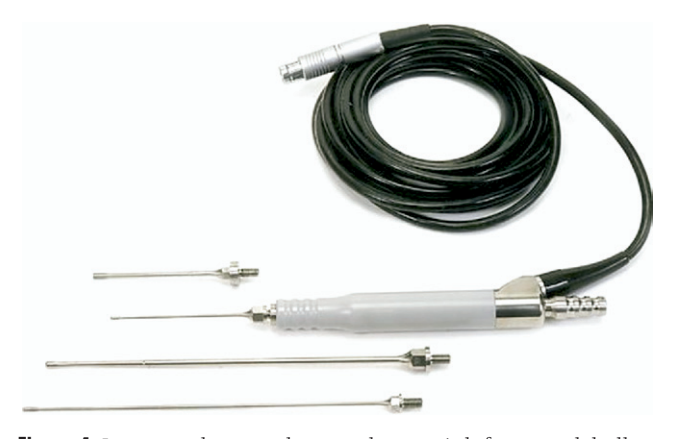
Figure 4 Lysonix ultrasound wave device. A bifunctional hollow cannula for simultaneous fat aspiration and liquefaction. (Color version of figure is available online.)

tion of adipocytes, resulting in rupture of their cellular membrane and liquefaction of fat, creating microcavitations. The probe is then moved in a smooth axial back-and-forth motion in a speed slightly slower than standard suction cannula. Unlike traditional liposuction technique, care must be made to avoid tenting the skin to reduce "end hits," which results from the tip of the probe impacting the undersurface of the skin causing skin necrosis. Because these instruments penetrated the subcutaneous tissue so easily, complications such as thermal burns, skin necrosis, scarring, seroma formation, and peripheral nerve injury were initially reported.<sup>13,14</sup> Since then, manufacturers have increased the diameter of the ultrasound device and required skin protectors at the entry sites to avoid burns.