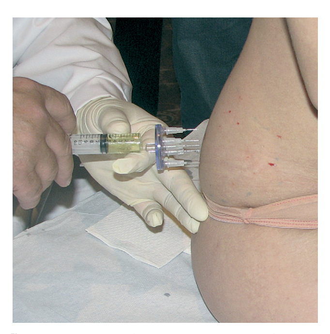
Figure 8 Injection device for Lipodissolve. (Color version of figure is available online.)

case study of 43 patients with 117 injection sites.<sup>37</sup> Thirty percent of patients reported dramatic improvement, while 67% of patients reported mild to moderate improvement in treated areas.