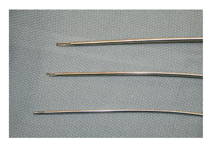
Figure 2 Range of cannula tips with various sizes and number of ports. (Color version of figure is available online.)

Although traditional liposuction is advantageous for large areas of fat removal or for multiple sites, manual syringe liposuction is well-suited for fine contouring areas such as