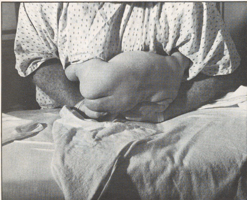
Figure 3. Technique for holding a struggling child.

In contrast to older children and adults where up to five white blood cells per ml is considered normal, newborn spinal fluid may contain up to 20 white blood cells per ml including a significant portion as polymorphonuclear leukocytes. In the presence of bloody spinal fluid, increased numbers of white blood cells will be seen, but the count should be elevated only in the same RBC:WBC ratio seen in newborn blood (250-500:1).