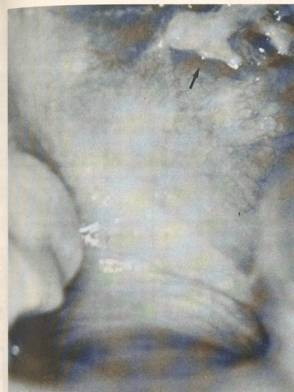
Figure 1. Puncture wound of the right posterolateral soft palate.