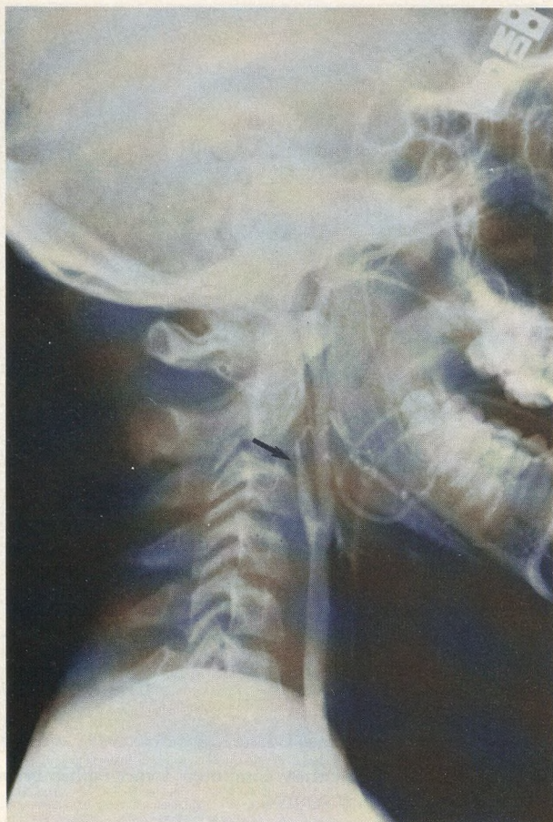
Figure 3. Carotid angiogram of the right side demonstrating marked tapering and total occlusion of the internal carotid lumen 3 cm above its origin.

Thrombus embolization with associated transient ischemic attacks can be an important clue to the presence of ICA injury and provide the astute clinician with a window of therapeutic opportunity.