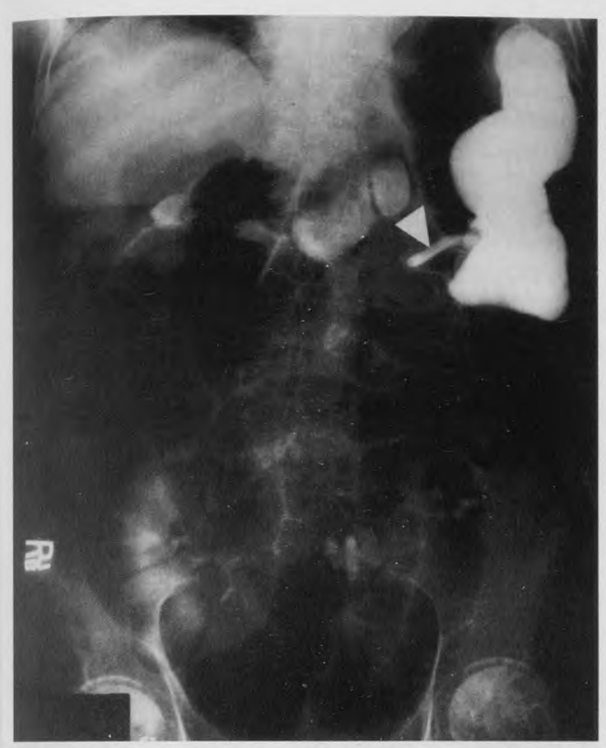
Figure 1. Radiographic study demonstrates filling of the colon rather than the stomach during instillation of Gastrografin. The PEG tube is indicated by the arrow.