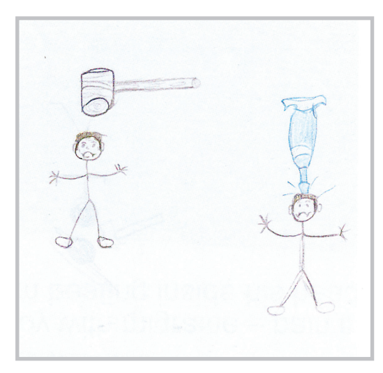
A 10-year-old boy draws his "bad" (large hammer) and "really bad" (jackhammer) headaches.