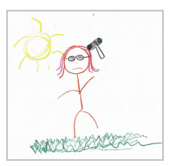
A 13-year-old girl with migraine depicts photophobia (sunglasses) and pounding pain (hammer).