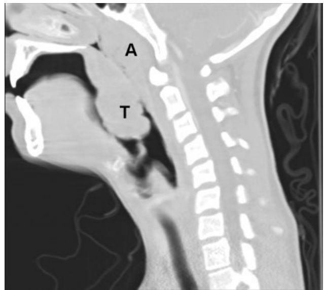
FIGURE 1. Sagittal reconstructions from neck CT scan. "A" represents adenoidal hypertrophy compromising her nasopharynx, and "T" is massive tonsillar enlargement labeled as causing nearly complete obstruction of her oropharyngeal airway.

Most patients with infectious mononucleosis (IM) have a benign, self-limited course. However, a wide range of severe complications have been described including airway obstruction, splenic rupture, meningoencephalitis, Guillain-Barré syndrome, peritonsillar abscess, and hemolytic anemia. 1,2 Upper-airway obstruction results from lymphoid hyperplasia throughout Waldeyer's ring, with associated soft-tissue edema. As many as 25% of patients hospitalized for IM will have some degree of airway obstruction. 2,3 Peritonsillar abscesses (PTAs) occur in approximately 1% of hospitalized patients with IM and may further obstruct the airway. 4 Most commonly, peritonsil-