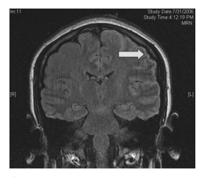
FIGURE 1. Brain MRI showed significant enhancement with gadolinium in the cortex and leptomeninges of left parietal and posterotemporal lobes and right cingulate gyrus region.

unit, and phenytoin and levetiracetam were administered. Over the next several days, she remained afebrile, and her leukocytosis resolved. She continued to have seizures every day despite receiving phenytoin, levetiracetam, and lamotrigine. She was alert and complained about persistent right arm weakness and word-finding difficulties. Posterior cervical lymphadenopathy at the base of her left occiput was detected on subsequent exam.