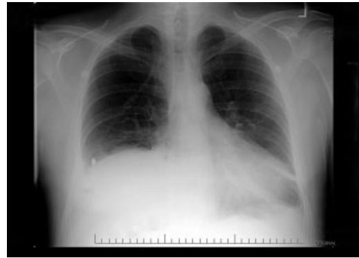
FIGURE 2. Chest radiograph obtained on the third hospital day revealed an elevated right hemidiaphragm and bilateral effusions.

A significantly elevated right hemidiaphragm makes me reconsider the diagnosis of simple community-acquired pneumonia. The differential diagnosis for an elevated hemidiaphragm is best con-