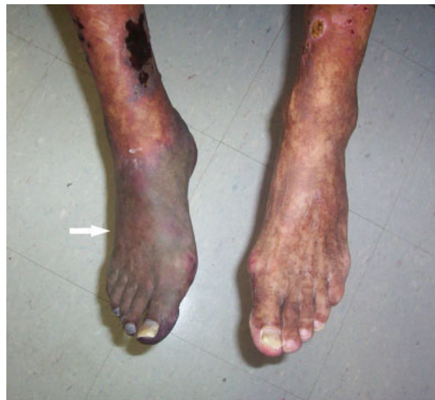
FIGURE 2. Right-foot gangrene.