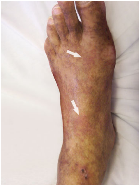
FIGURE 1. Left-foot purpura.

His clinical and laboratory findings were attributed to mixed cryoglobulinemia, and treatment, consisting of daily intravenous methylprednisolone, a single dose of intravenous cyclophosphamide, and plasmapheresis, was initiated. Despite these interventions, 5 days later, he developed severe burning pain in the right extremity with worsening discoloration and a line of demarcation at the level of his proximal midfoot. Eventually, right below the knee, amputation was performed, and histopathological examination